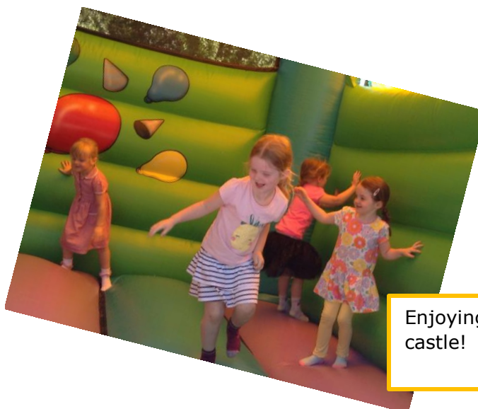
Enjoying the bouncy castle!