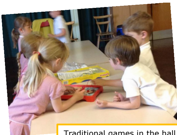
Traditional games in the hall included Twister, pick up sticks, Operation and Lego.