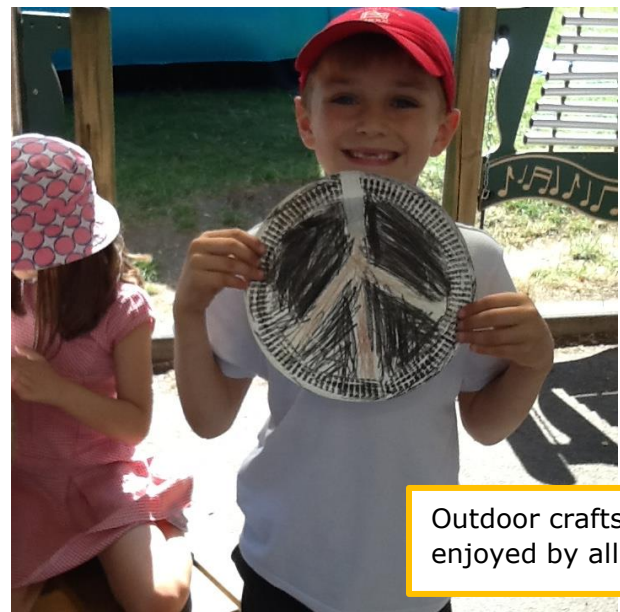
Outdoor crafts were enjoyed by all.