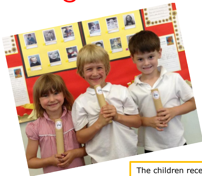
The children received a gift in assembly from FoSG.